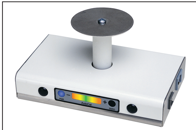
Figure 1. EMIT Auto Calibration Unit, Item 50610.