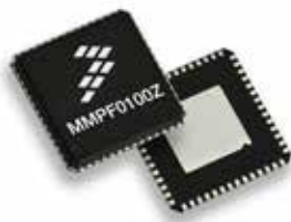
MMPF0100Z PMIC Wetable Flank Package for Automotive