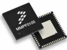
MMPF0100 PMIC Package for Consumer and Industrial