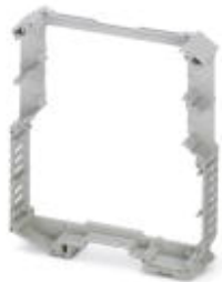
Intermediate element, Central part, width: 17.6 mm, color: light gray (7035)

Please be informed that the data shown in this PDF Document is generated from our Online Catalog. Please find the complete data in the user's documentation. Our General Terms of Use for Downloads are valid ( http://phoenixcontact.com/download )