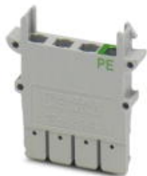
Connector housing, length: 31.6 mm, width: 5.2 mm, height: 31.7 mm, number of positions: 1, color: gray

Please be informed that the data shown in this PDF Document is generated from our Online Catalog. Please find the complete data in the user's documentation. Our General Terms of Use for Downloads are valid ( http://phoenixcontact.com/download )