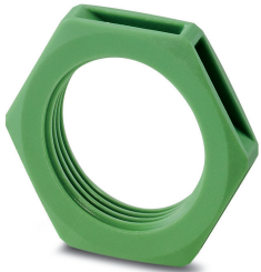
Color-coding, Range of articles: PRC 35, Nut, color: green

Please be informed that the data shown in this PDF Document is generated from our Online Catalog. Please find the complete data in the user's documentation. Our General Terms of Use for Downloads are valid ( http://phoenixcontact.com/download )