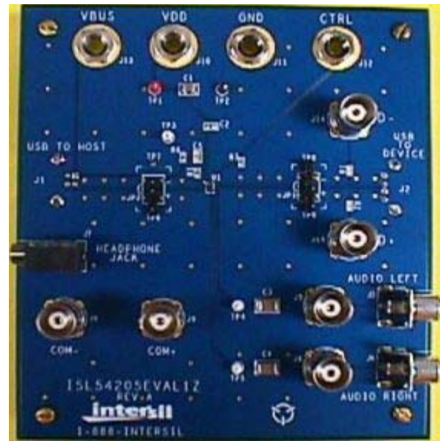
FIGURE 1. ISL54205BEVAL1Z EVALUATION BOARD (TOP VIEW)