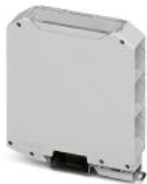
DIN rail housing, Complete housing with metal foot catch, flat design, without vents, width: 22.5 mm, color: light gray (7035)

Please be informed that the data shown in this PDF Document is generated from our Online Catalog. Please find the complete data in the user's documentation. Our General Terms of Use for Downloads are valid ( http://phoenixcontact.com/download )