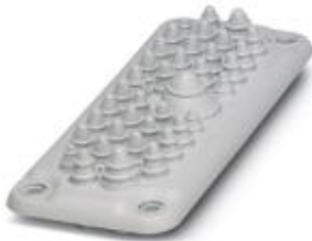
Cable feed-through plates, No. of conductors: 37, Length: 92 mm, Width: 222 mm, Height: 43 mm, Color: light gray

Please be informed that the data shown in this PDF Document is generated from our Online Catalog. Please find the complete data in the user's documentation. Our General Terms of Use for Downloads are valid ( http://phoenixcontact.com/download )