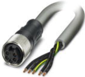
Power cable, 5-pos., gray PUR/PVC, 2.5 mm 2 , free cable end to straight 7/8" 16UNF socket, length: 3.0 m

Please be informed that the data shown in this PDF Document is generated from our Online Catalog. Please find the complete data in the user's documentation. Our General Terms of Use for Downloads are valid ( http://download.phoenixcontact.com )