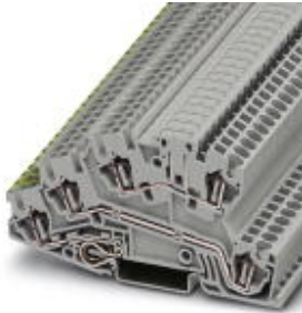
Installation level terminal block, Spring-cage connection, Cross section: 0.08 mm 2 - 4 mm 2 , AWG: 28 - 12, Width: 5.2 mm, Color: gray, Mounting type: NS 35/7,5, NS 35/15

Please be informed that the data shown in this PDF Document is generated from our Online Catalog. Please find the complete data in the user's documentation. Our General Terms of Use for Downloads are valid ( http://download.phoenixcontact.com )