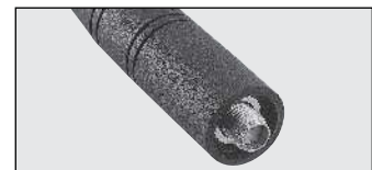
SMA F T3

SMA Female recessed insulator & partial (long) skirt (SFU type)