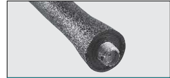
SMA F T2

SMA Female recessed insulator & partial (short) skirt (SFJ type)