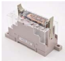
FGRM Kit Relay + Socket

FGRM Safety Relay and Socket Kits will be Discontinued April 1, 2015; Replace with G7SA and P7SA Piece Parts