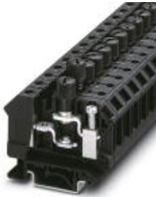
Fuse terminal block for cartridge fuse insert, cross section: 0.5 - 16 mm 2 , AWG: 24 - 6, width: 12 mm, color: black

Please be informed that the data shown in this PDF Document is generated from our Online Catalog. Please find the complete data in the user's documentation. Our General Terms of Use for Downloads are valid ( http://phoenixcontact.com/download )