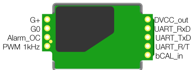
Figure 2. Pin assignment