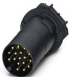
Sensor/actuator flush-type plug, 17-pos., A-coded, with straight THR solder connection, contact insert only

Please be informed that the data shown in this PDF Document is generated from our Online Catalog. Please find the complete data in the user's documentation. Our General Terms of Use for Downloads are valid ( http://phoenixcontact.com/download )