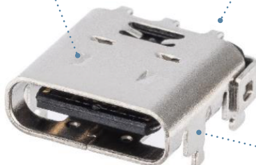
USB 2.0 Type-C Receptacle, Top-Mount, 16 Circuit (213716 Series)

Metal shell Provides strength/robustness to the connector