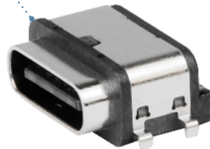
USB Type-C Receptacle, 6 Circuit (217177 Series)