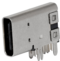
USB Type-C Receptacle, Upright, 14 Circuit (216989 Series)