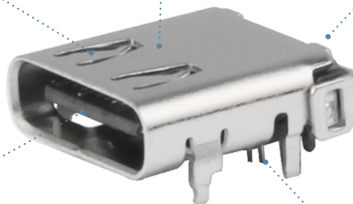
USB 3.2 Type-C Receptacle, Top-Mount, 24 Circuit (217183 Series)

Top-mount and mid-mount USB 3.2 type-c receptacles Offer design flexibility