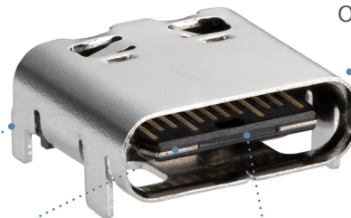
USB4 Type-C Receptacle, Top-Mount, 24 Circuit (105450 Series)

Provides space savings and design flexibility