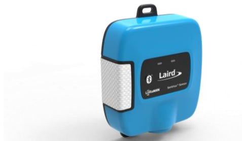
The Sentrius™ RS1xx Series LoRa/BLE sensor features integrated antennas, temperature and humidity sensors in rugged enclosures.