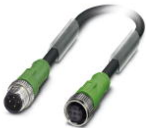
Sensor/actuator cable, 4-position, PUR, black-gray RAL 7021, Plug straight M12, A-coded, on Socket straight M12, A-coded, cable length: 2 m

Please be informed that the data shown in this PDF Document is generated from our Online Catalog. Please find the complete data in the user's documentation. Our General Terms of Use for Downloads are valid ( http://phoenixcontact.com/download )