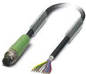
Sensor/actuator cable, 8-position, PUR halogen-free, black-gray RAL 7021, shielded, Plug straight M8, on free cable end, cable length: 3 m

Please be informed that the data shown in this PDF Document is generated from our Online Catalog. Please find the complete data in the user's documentation. Our General Terms of Use for Downloads are valid ( http://phoenixcontact.com/download )