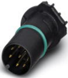
Sensor/actuator flush-type plug, 8-pos., with straight THR solder connection, only contact insert

Please be informed that the data shown in this PDF Document is generated from our Online Catalog. Please find the complete data in the user's documentation. Our General Terms of Use for Downloads are valid ( http://phoenixcontact.com/download )