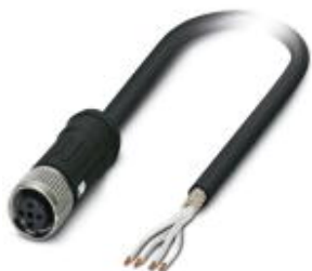
Sensor/actuator cable, 4-position, PE-X halogen-free, black, shielded, free cable end, on Socket straight M12 SPEEDCON, A-coded, cable length: 10 m, For railway applications

Please be informed that the data shown in this PDF Document is generated from our Online Catalog. Please find the complete data in the user's documentation. Our General Terms of Use for Downloads are valid ( http://phoenixcontact.com/download )