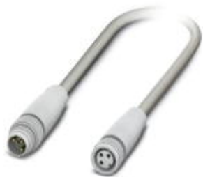
Sensor/actuator cable, 3-position, PP-EPDM halogen-free, gray RAL 7035, Plug straight M8, on Socket straight M8, cable length: 0.6 m, Hygienic design, with plastic knurl

Please be informed that the data shown in this PDF Document is generated from our Online Catalog. Please find the complete data in the user's documentation. Our General Terms of Use for Downloads are valid ( http://phoenixcontact.com/download )