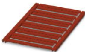
The figure shows the UCT-TMF 5 version

UniCard materials for thermal transfer printers, for labeling Weidmüller, Conta Clip, and Klemsan terminal blocks with horizontal marker groove, 72-section, can be labeled with THERMOMARK CARD and BLUEMARK LED, color: red