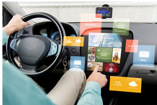
Figure 1. Vehicle infotainment systems are among the automotive applications that would benefit from precise, flexible, and small power management solutions.

In fast-growing segments like ADAS modules, infotainment head units, and smart instrument clusters, many automotive engineers are powering each component via multiple power rails, often with specific voltage regulation precision requirements (Figure 1). To meet these stringent system requirements, automotive power management solutions that deliver precision, flexibility, and small solution size are essential. Thermal