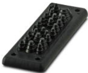
Cable feed-through plates, no. of conductors: 25, length: 154 mm, width: 56 mm, height: 20 mm, external cable diameter: 3x 3 mm ... 6 mm , color: black

Please be informed that the data shown in this PDF Document is generated from our Online Catalog. Please find the complete data in the user's documentation. Our General Terms of Use for Downloads are valid ( http://phoenixcontact.com/download )