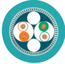
PUR ETHERNET 2x2 FLEX [93E]