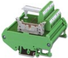
VARIOFACE input module, 16 channels for Siemens SIMATIC® S5-100U

Please be informed that the data shown in this PDF Document is generated from our Online Catalog. Please find the complete data in the user's documentation. Our General Terms of Use for Downloads are valid ( http://phoenixcontact.com/download )