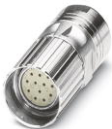
Cable connector, straight, Screw locking, M23, number of positions: 12, type of contact: Socket, Solder connection, shielded: yes, cable diameter range: 5 mm ... 13.2 mm

Please be informed that the data shown in this PDF Document is generated from our Online Catalog. Please find the complete data in the user's documentation. Our General Terms of Use for Downloads are valid ( http://phoenixcontact.com/download )