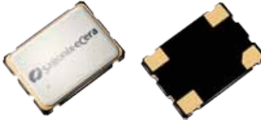
7.0 x 5.0mm Ceramic SMD