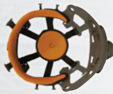
CLMBRSPN* *Shown with top pad and sweatband, all sold separately.