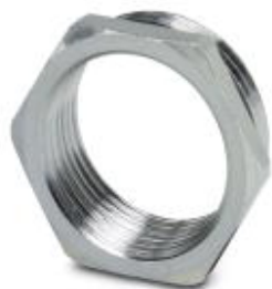
Reducing adapter, Brass, nickel-plated, connecting thread: Pg21, color: silver, with O-ring

Please be informed that the data shown in this PDF Document is generated from our Online Catalog. Please find the complete data in the user's documentation. Our General Terms of Use for Downloads are valid ( http://phoenixcontact.com/download )