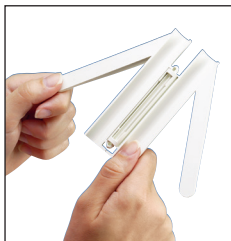
Open Pan-Wrap™ Tool and insert bundle.