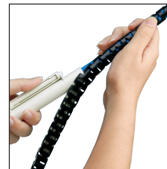
Grasp end of Pan-Wrap™ Split Harness Wrap and bundle while pulling the tool along the bundle length.