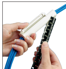
Slide Pan-Wrap™ Split Harness Wrap onto end of tool until approximately 3" of it covers the bundle.