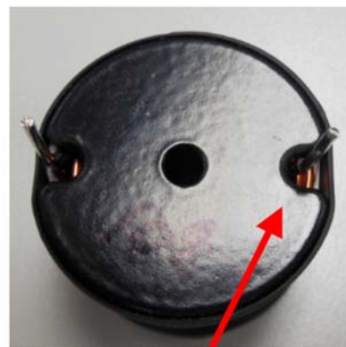
After Change - Larger Radius