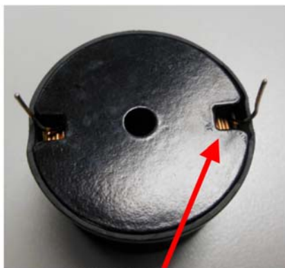
Before Change - Small Radius