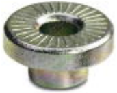
Special washer for floating mounting of docking frame