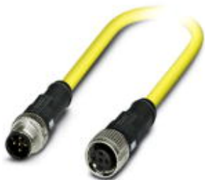
Sensor/actuator cable, 5-position, PVC, yellow, Plug straight M12 SPEEDCON, A-coded, on Socket straight M12 SPEEDCON, A-coded, cable length: 1.5 m

Please be informed that the data shown in this PDF Document is generated from our Online Catalog. Please find the complete data in the user's documentation. Our General Terms of Use for Downloads are valid ( http://phoenixcontact.com/download )